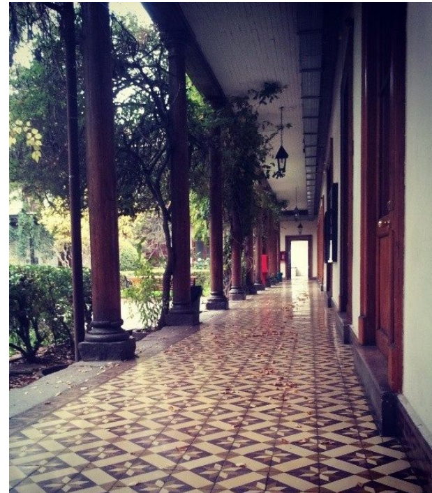
Universidad Mayor – Santiago de Chile / Chile