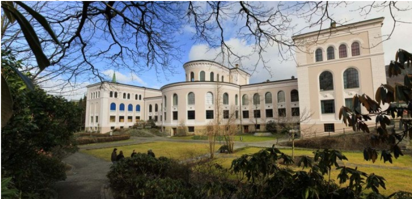
Universitetet i Bergen – Bergen / Norwegen