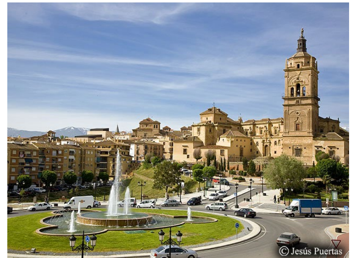
Universidad de Granada