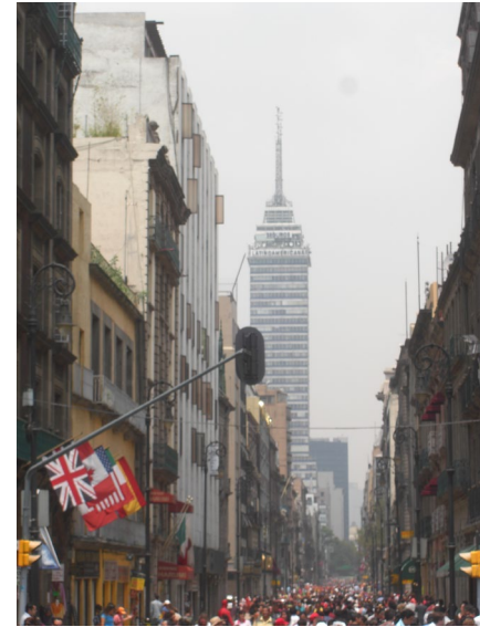
Mexiko Stadt / Mexiko