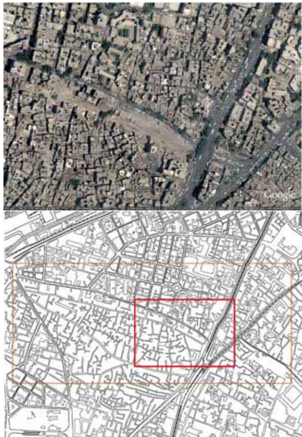
Bab Al Sharyah, Cairo, Study Area / Design Area