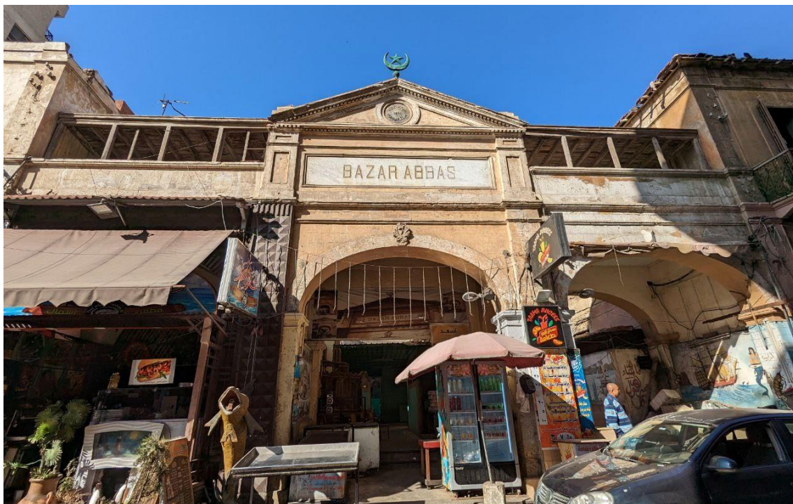
Fig 1. View to Entrance of Bazar Abbas – 19.12.2022

The project involves a series of training and workshops that build upon each other. The first workshop delved into site-specific studies in Port Said's Arab and European neighbourhoods, focusing on understanding how war and conflict have shaped local urban narratives and heritage interpretations. Central to this exploration was the timber veranda, or Taracina , a key element of Port Said's architecture. The second workshop concentrated on envisioning diverse scenarios for recovery of Port Said's urban core. Participants explored experimental design, heritage-led regeneration, critical reconstruction, climate-adaptive design, and socio-economic regeneration strategies. In the third workshop, participants underwent architectural conservation and reconstruction training, renovating two taracinas (balconies) and a section of the eastern façade of Bazar Abbas. The insights and outcomes collected from these workshops will be shared with current participants to deepen their contextual understanding and prepare them for subsequent work.