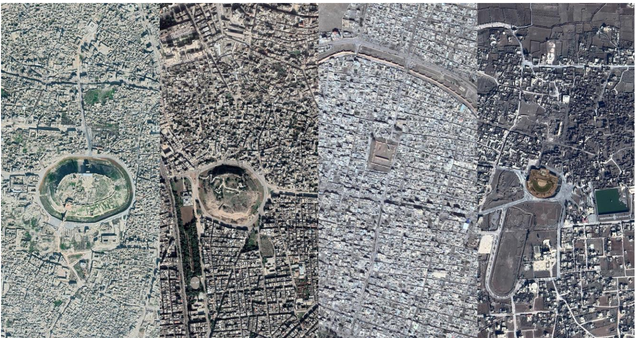
2021 Google Earth images of four historic cities of Syria., from left to right: Aleppo, Homs, Al-Raqqa, Bosra

German – Lebanese University Cooperation to Support Young Syrian Academics and Professionals 21-22