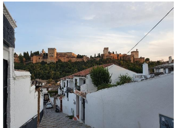
Alhambra viewed from the Albaycín