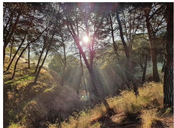
Forest behind San Miguel