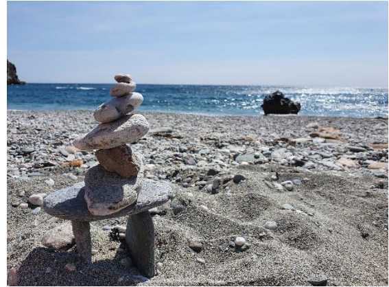
Playa de la Rijana