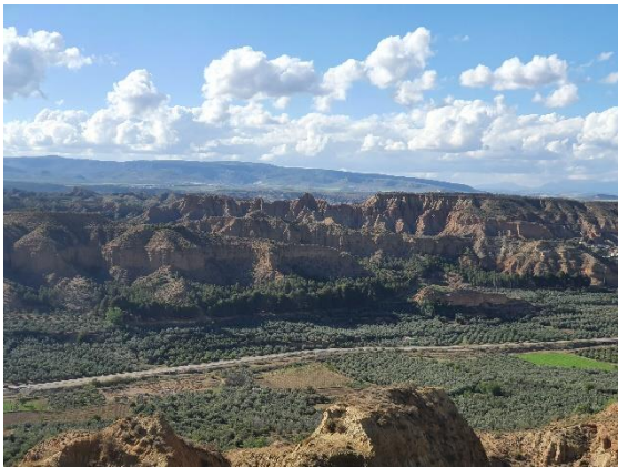
Canyons of Guadix