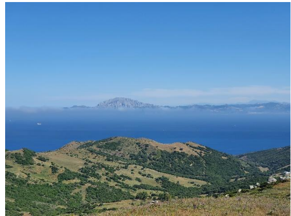
Morocco view from the Iberian Peninsula