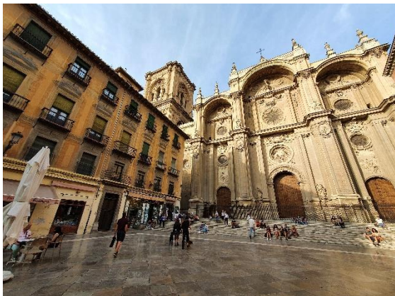
Cathedral of Granada

“University is also about life experiences, seize opportunities to broaden your horizons.”