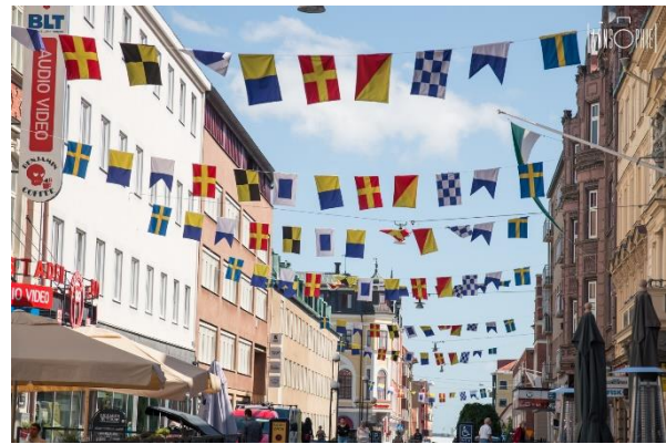
Karlskrona City Centre

After I finally got the acceptance and necessary material from the university, I started looking for accommodation. That's where I first found out that living in a country that has its own currency and a strong economy would not be cheap. The main website used for student accommodation is Karlskronahem.se. They offer a lot of different and rather cheap rooms for students. The main student areas are Kungsmarken, Pantarholmen and Galgmarken. The rooms are available from around 300 € per month. Unfortunately, their assignment procedure is really disappointing and I got very frustrated after some time. First, I had to sign up on their website (which was not easy to get through back then – I think they changed a few things by now) and then choose where and when I wanted to rent a room. First of all, there were not many offers and they often came in with short notice (a week or so before the move-in-date) and if I liked one, I had to immediately sign myself in for that. With a lot of luck, I would become one of the 5 chosen ones to get to the next stage. It happened to me once (out of at least 7 rooms I signed up for) and I had to send them an email within 24 hours in which I accept the offer. After that it was time to wait again and hope that the 3 or 4 persons before me didn't manage or didn't