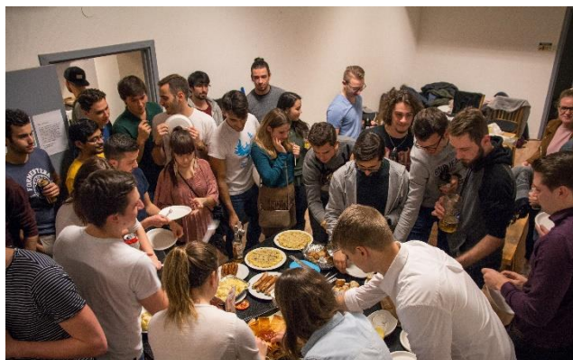
Dinner Party at the Jail

want to answer to that email and I would get the room. Unfortunately I was unlucky (I later found out that other students used programs or websites to automatically sign up for the rooms immediately – unfair 😊). Since I only had a few days left until my departure to Karlskrona, I got under pressure and chose to live in "The Jail". The Jail is a former prison which is now reused for student housing / as a hostel. The