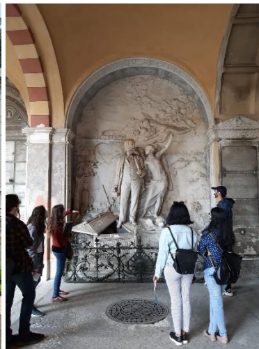
Visit to the Monumental Cemetery