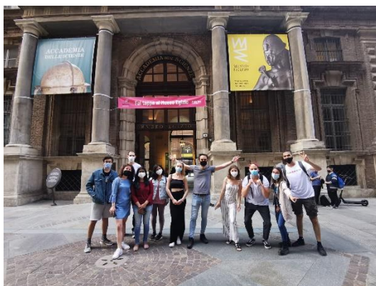
ESN trip to 'The Egyptian Museum'