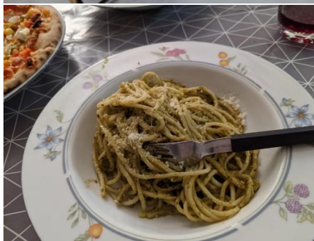
Trying the local cuisine