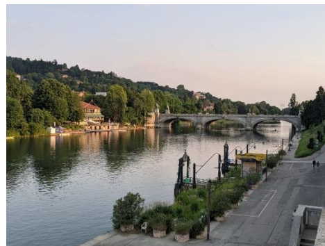
The River 'Po'