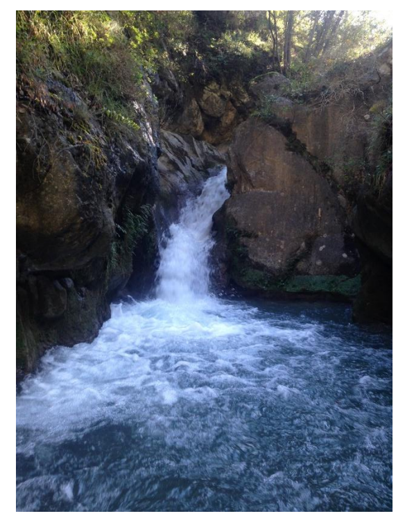
Practical class - Esteron river