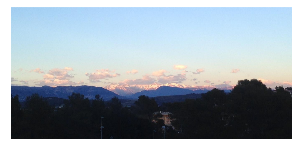
The Alps. View from the classroom