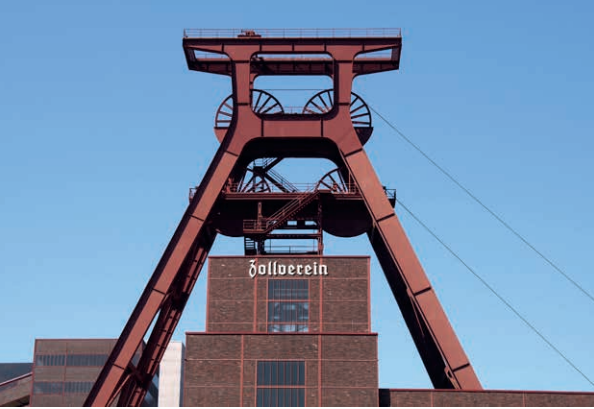
◀ Headframe in Zeche Zollverein (Germany)