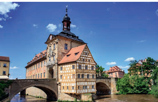
◀ Historic City Hall of Bamberg (Germany)

Due to its location, Cottbus has a history as an intersection of trading routes between Germany, the Czech Republic and Poland. In the 19th century the city specialised in the production of textiles and afterwards in coal mining and energy generation. Cottbus belongs to the region of the Lausitz, the home of one of Germany's officially recognised minorities, the Sorbs. The Sorb culture has enriched the area of the nearby Spreewald since the 8th century which was recognised as an UNESCO Man and Biosphere Reserve in 1991.