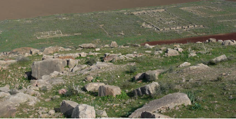
◀ Archaeological Remains in Chintou (Tunisia)