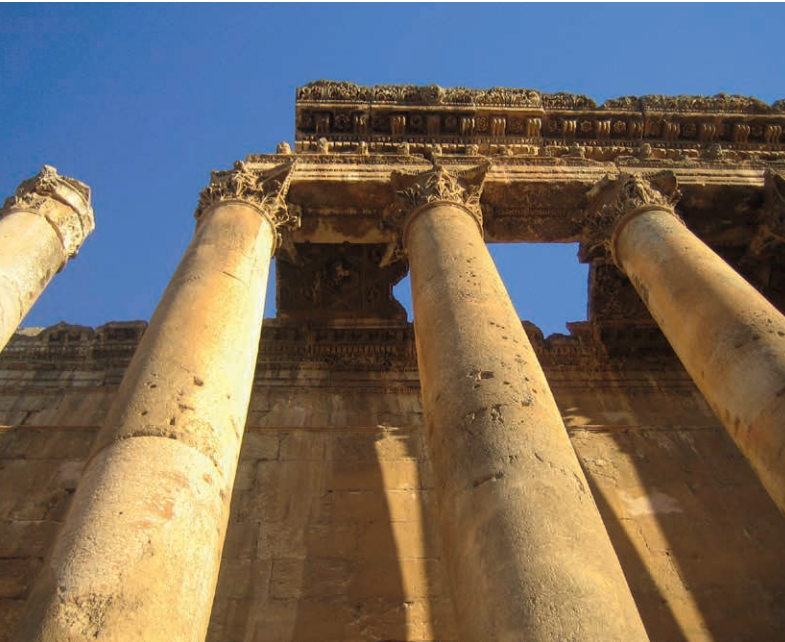
◀ Temple of Bacchus, Baalbek (Lebanon)

The programme focusses on transferring knowledge and methodologies required for the administration and management of cultural heritage sites, particularly archaeological sites and ruins, such as assessment of cultural significance, documentation of sites, strategies and methods of conservation, strategic heritage management