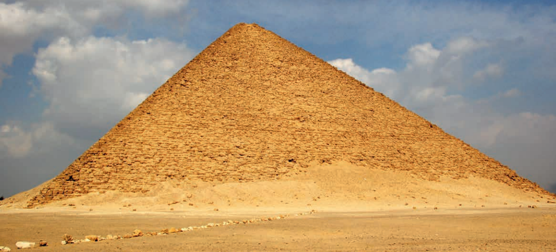
Red Pyramid of Dahshour (Egypt)

and planning, visitor management, presentation and interpretation of sites, as well as general leadership skills and good knowledge of the tourism sector. The variety of these subjects will endow graduates with the multidisciplinary skills required for the assessment of significance as well as the management and protection of cultural heritage sites.