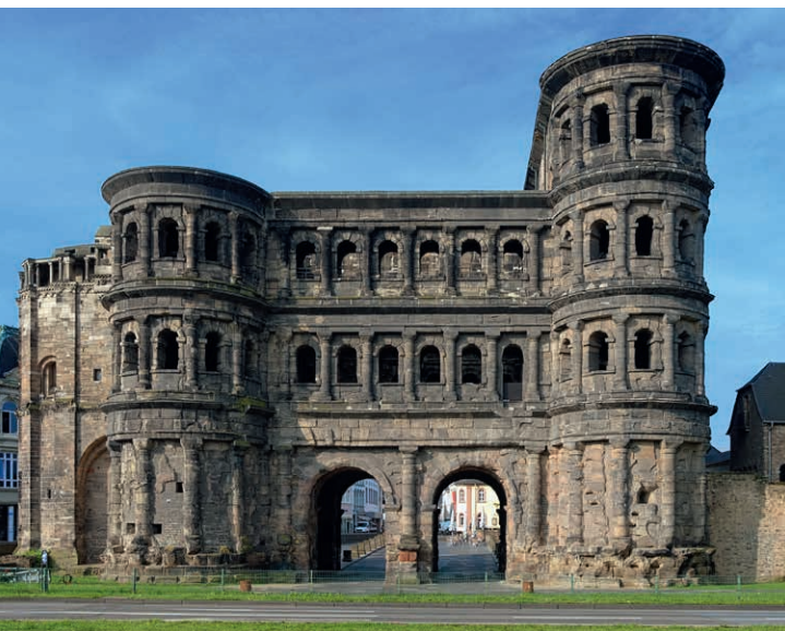
◀ Porta Nigra, Trier (Germany)