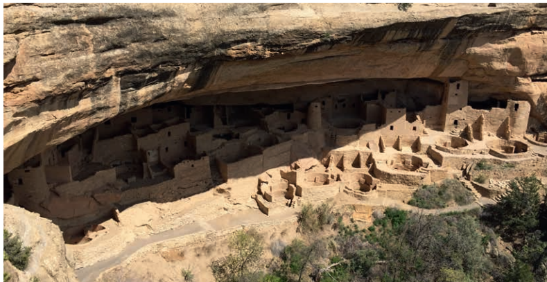
Cliff dwellings in Mesa Verde (USA) >

This module introduces students to the field of museology and to the contemporary museological discourse. It covers a variety of topics such as early history of museum formation, types of museum exhibitions and collections, the social and economic functions of museums and the theories of art and history that structure museums today.