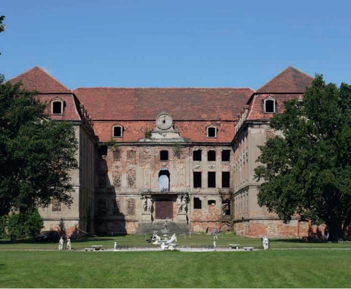
◀ Ruins of Castle Brody (Poland)

chosen home university. For the second semester, all students come together in Cottbus to be taught at BTU whereas the third semester is taught for the whole intake in Cairo at Helwan University. Students will then conclude their master with the fourth semester again at their respective home university.